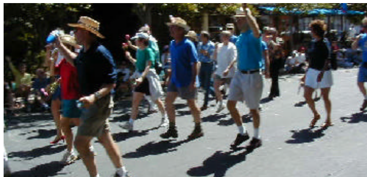
FHA Kazoo Band cavorts at Sausalito 4 th of July Parade.

I'd like to offer a brief and heartfelt "Thank You" to all of you who thought about me, sent me cards and letters, and called offering so much help last year when I had my heart bypass. I have never felt as much concern and caring and scarcely a day goes by without my remembering. It reminds me of a very important reason to live here.